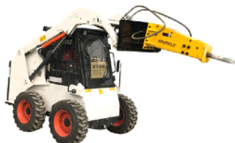
SKID STEER JACK HAMMER