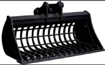
SKIDSTEER SIEVE BUCKET