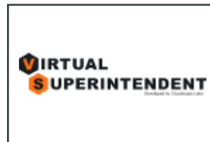
Compatibility with Virtual Superintendent Systems