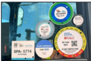
Project Inducted Equipment