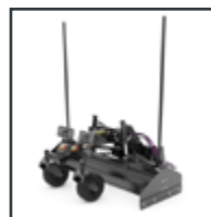
Dual Grade Box Grader (Laser Guided)