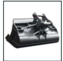
Sieve and Tilt Buckets