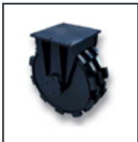
Compaction Plates and Wheels