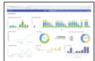
Detailed Usage Reporting