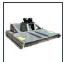
Slashers and Forestry Mulcher