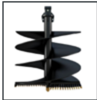
Augers 100mm - 1500mm