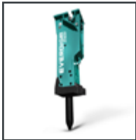
Hydraulic Rock Breakers