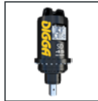
Specialist Screw Pile and High Torque Drives PD50 - SD80