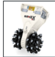
Drum Cutters (Pineapples)